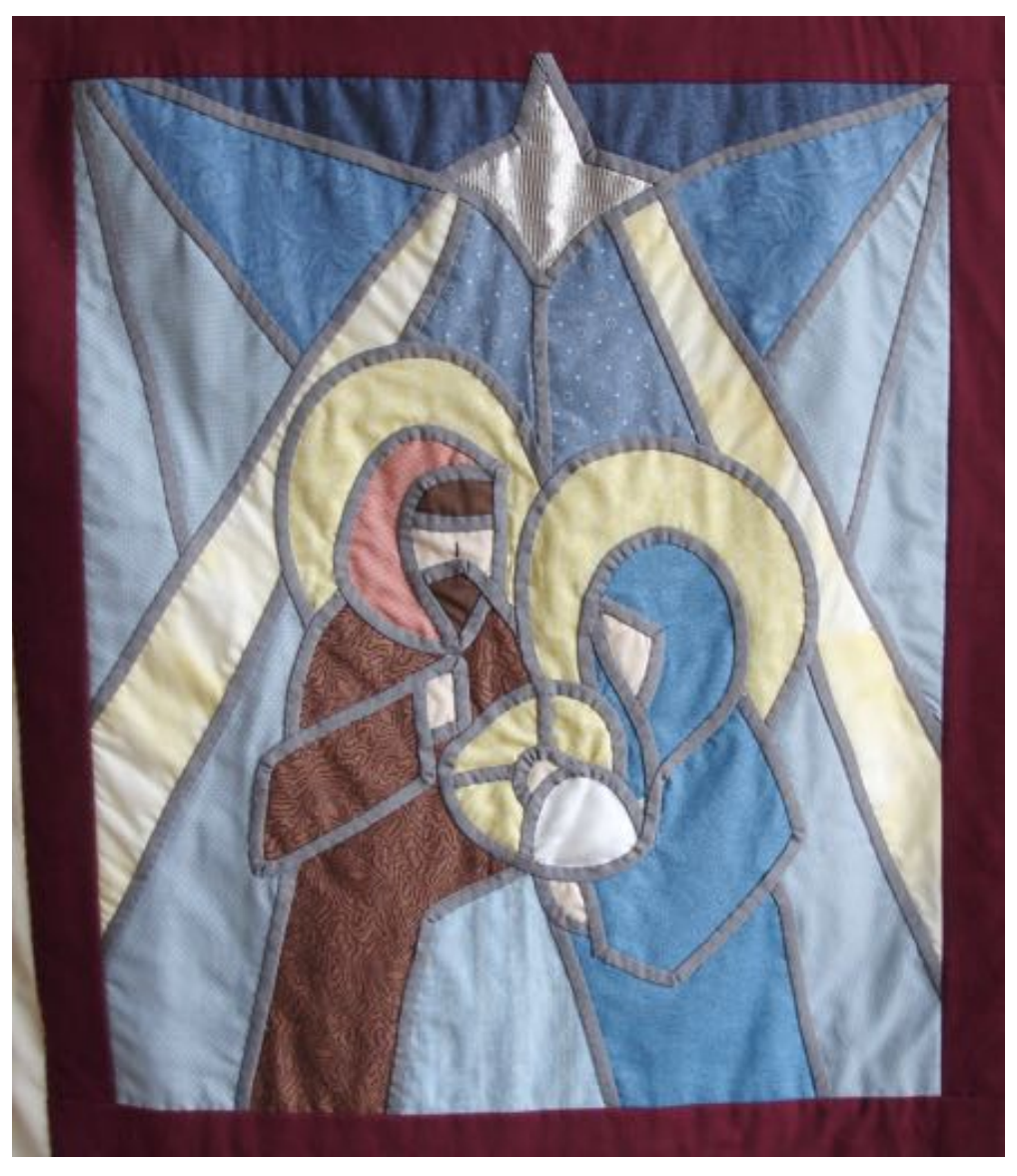
The Cotteridge Church Witnessing at the Heart of the Community