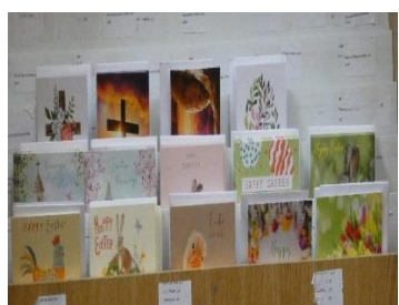
A new selection of Easter Cards are now available