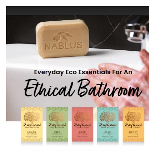
The natural, botanical ingredients within these soaps, including the world-renowned Palestinian olive oil, nourish and moisturise skin, whilst supporting its natural balance.

Nablus olive oil soap with lemon 5.00 Nablus pure olive oil soap 5.00 Nablus olive oil soak with rose 5.00 Nablus olive oil soap with sage 5.00 Nablus olive oil soap with honey 5.00 Nablus olive oil soap gift pack 19.50