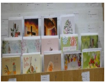
A new selection of Easter Cards are now availbe