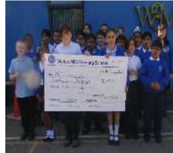
Class 5 with cheque for £338.95 Watermill JI.]

The foodbank received in donations 1779k Street collections from Featherstone Rd, Third Avenue Teazel Avenue, Tudor Close and Selly Park The foodbank gave away 1360k 1232k to 101 people on 53 vouchers and 159k to other foodbanks or similar