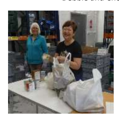
Last Week we received in donations 1573kgs and used 1128kgs out 1095 to feed 84 clients on 48 vouchers and 38 to other foodbanks or similar