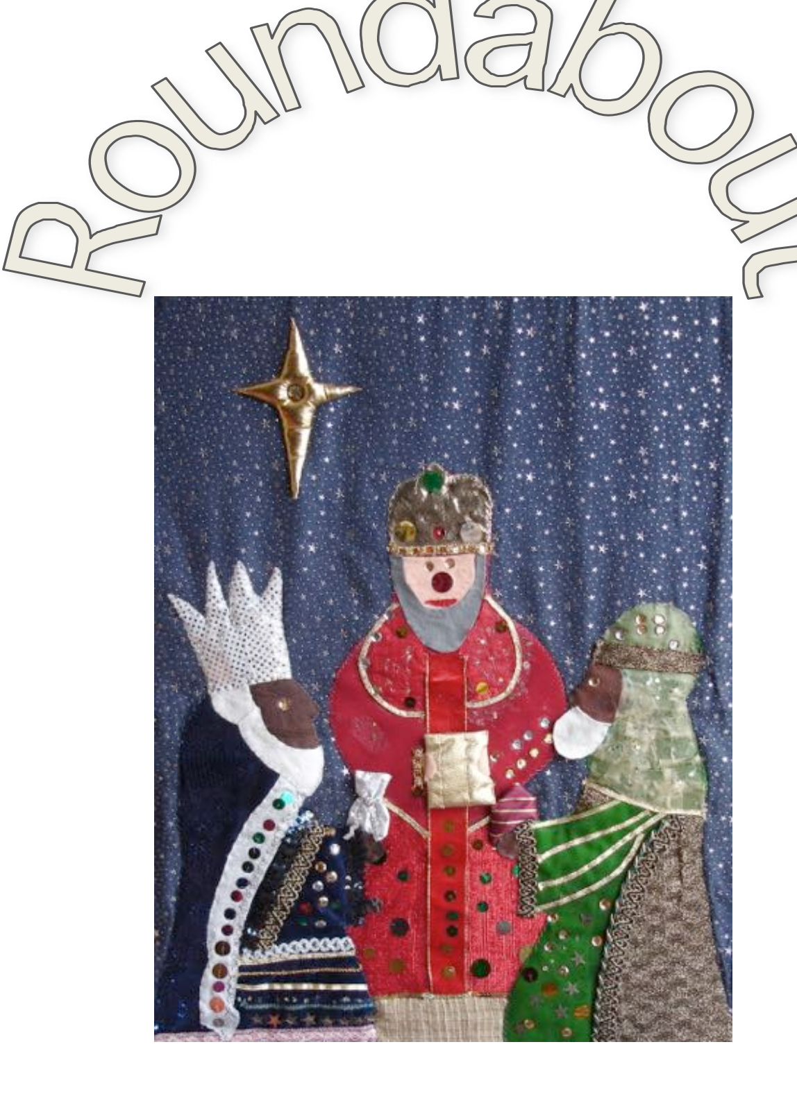
The Cotteridge Church Witnessing at the Heart of the Community January 2024