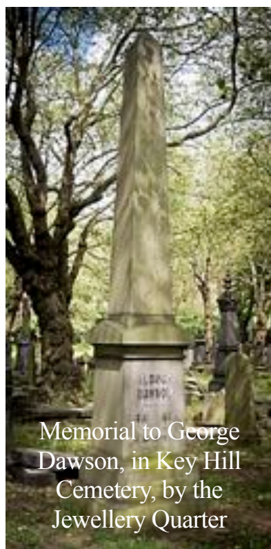
Memorial to George Dawson, in Key Hill Cemetery, by the Jewellery Quarter

Inspired by his non-conformist beliefs the preacher George Dawson declared “A town is a solemn organism through