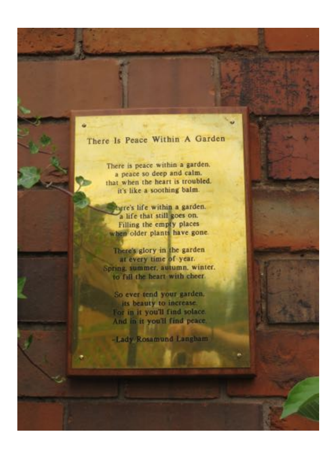
This plaque is on the wall of the vestry in the Bible garden