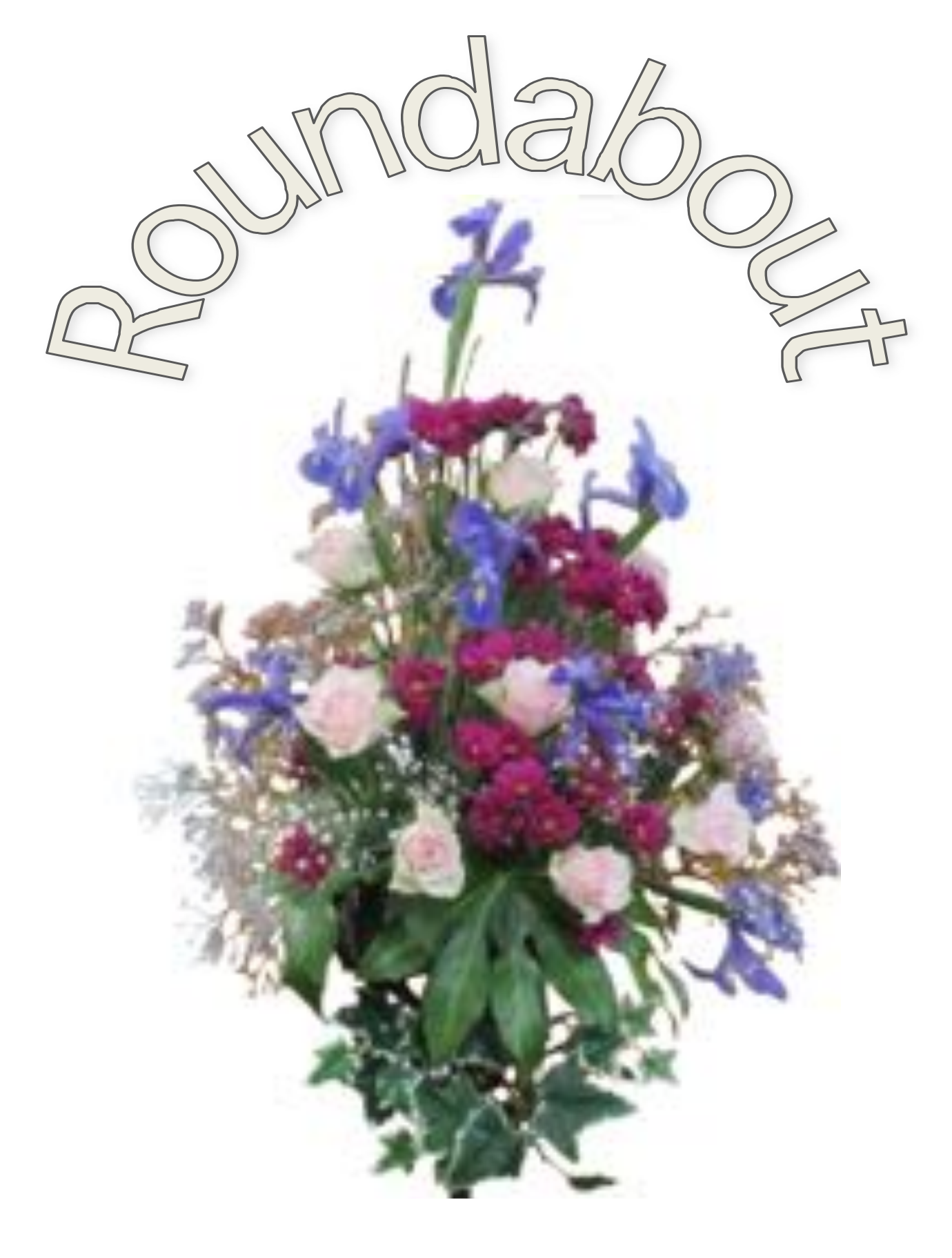
The Cotteridge Church Witnessing at the Heart of the Community